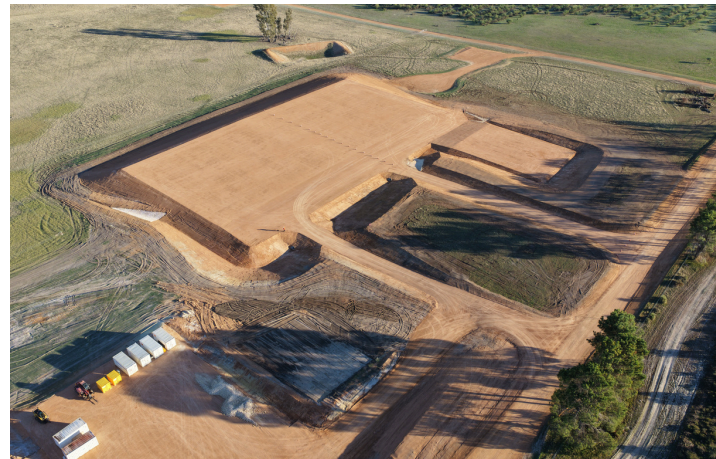
Figure 1: Completion of bench where the substation will be located.