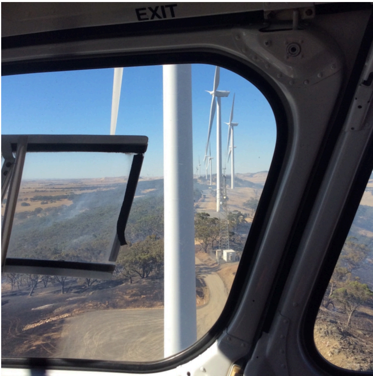
Figure 2: CFS Fighting the Waterloo Fire in 2017 at Waterloo Wind Farm

Yes, aerial firefighting can occur within and around the Project. Several fires in Australia have been fought with helicopters and fixed wing planes around wind farms. Our operations team are in direct contact with emergency services and can immediately halt the operation of the wind farm to allow safe aerial firefighting around the turbines.