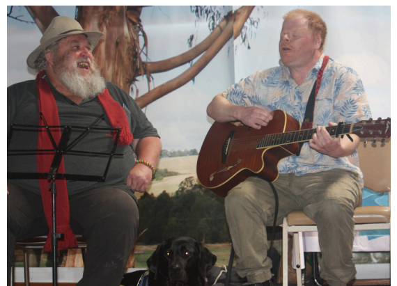
Photos: Music at the Headway Gippsland Disability Day Community Expo.

Tilt Renewables was pleased to support Prosocial Activity Funds for local children and young people. A total of $2000 enables children and young adults to access quality of life activities, which they may otherwise not participate in. Funds typically go towards petrol and taxi vouchers, theatre performances, local leisure center access, cinema tickets, bowling and zoo access.